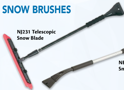
NE440 Telescopic Snow Brush