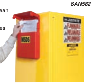
Use nearly anywhere! 4 sizes - 3 styles